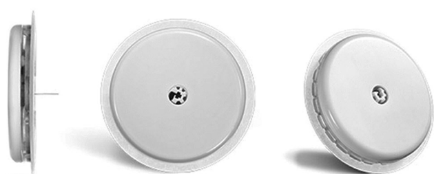
Figure 1: Freestyle Libre continuous glucose monitoring patch.

'I would like to know how my baby is because I had to have a premature baby because of the dangers that I had since they discovered that I got high blood pressure.