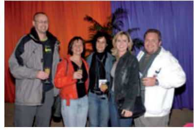
Scenes from the Nutrition Congress 2006